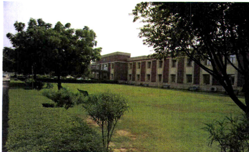
Lush Green Campus (A Block)